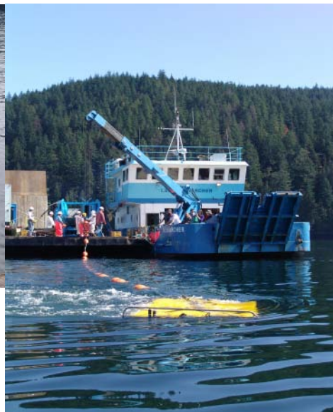
SNK ROV trials and training off ISE's research vessel