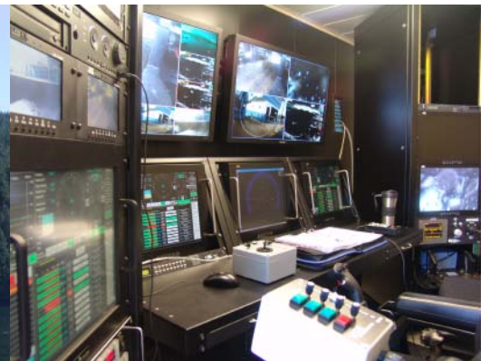
SNK ROV Console