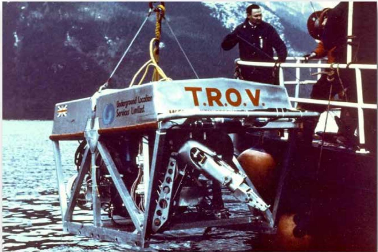
TROV (Tethered Remotely Operated Vehicle) One of the first ROV's developed by ISE in 1976

ISE's ROV product lines form one of the core elements of its overall business structure. We have designed and built ROVs for commercial, scientific and military applications. Our ROV's are delivered in standard or custom configurations to meet our customer's requirements from 5 to 600HP and up to 6000 meters of depth.